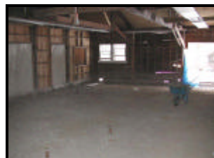
Onteora's version of Dining al fresco!

KEEPING THE HOME FIRES BURNING: Burns Ford of Huntington donated used kitchen equipment which will be used to trade to Kaiser Kitchen Equipment Co. in order to keep down the cost of the new kitchen equipment that will be ordered for the Long House renovation. The views below are thanks to the sweat equity of loyal volunteers who have begun the renovation process!