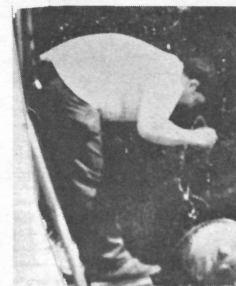
"A HARD WORKING BROTHER AT A WORK WEEKEND"