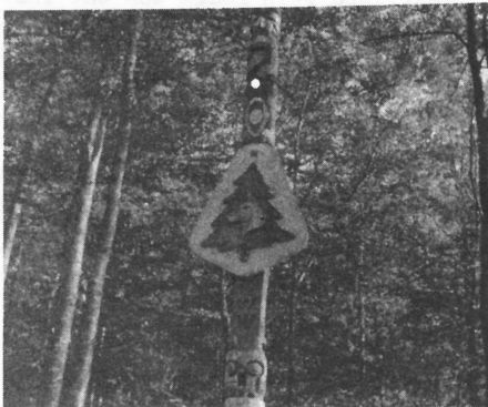
"MINDFUL NOW OF YOUR INTENTIONS"