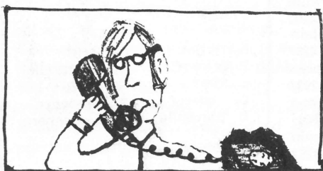
My TAB is late!

Do you remember your first uniform? Do you know where that uniform is right now? It's probably in some box somewhere in your basement. How about giving some scout the same pride that you had in that uniform? After all, what are you going to use it for anyway? So put that old uniform to good use. Bring it down to the cavalcade and give it to the Inter-relations Committee. We'll see that a scout will get that uniform, and put the same pride that you had into it. Don't worry if it needs repair. It will be done. So help another scout. Give him a uniform to be proud of.