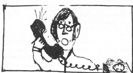
JOIN the Help Committee!!