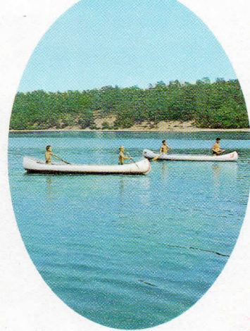
Wauwepex — "The Place of Good Water"

Located on Long Island about 40 miles east of Nassau County, on Manorville Road between Route 25 and 25A near the village of Wading River. Endowed with a scenic and natural beauty unexcelled on Long Island — a background of 45 years of operation — of ever improvement and modernization of facilities, as well as program. Camp Wauwepex is one of the Country's finest Boy Scout Camps. Program opportunities include all phases of aquatics, canoeing, boating, fishing, riflery, archery, hiking, cooking and conservation.